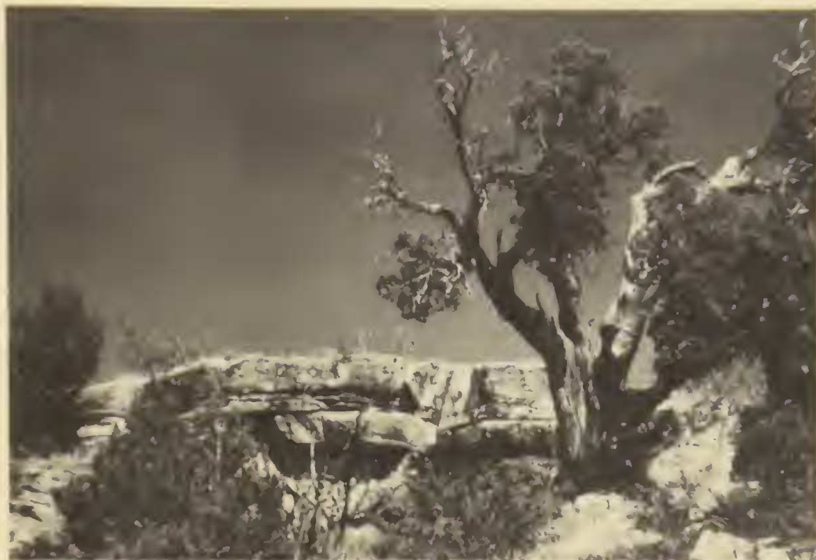
FIG. 3.—Rocky outcropping on Romero Creek, Oldham County.